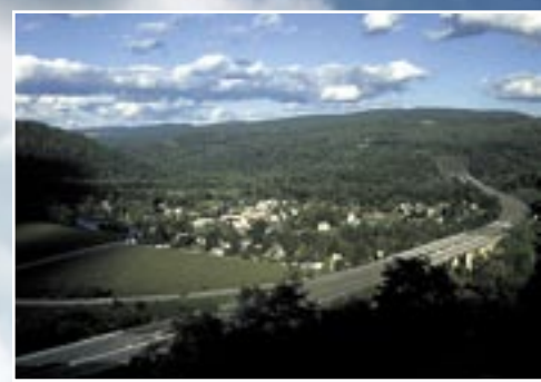
Come for a few hours, a day or a lifetime.