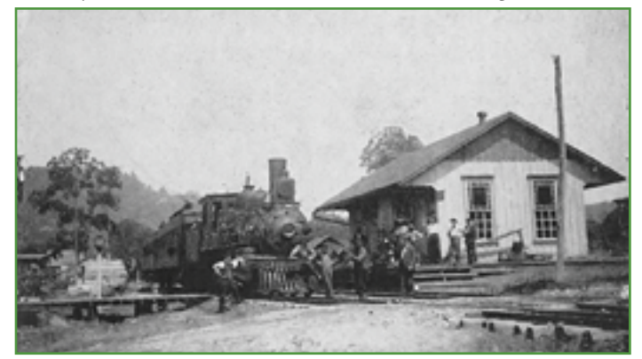
Friendsville's Train Station late 1800's.

Friendsville's vibrant community was established in 1765 and officially founded in 1902. This location along the river was a long time summer encampment used by the Shawnee Indians and known as "The Hunter's Bowl." The Friend Family Association and Museum is available to explore the town's history and to do genealogical research in its extensive family library. Information at VisitFriendsville.org